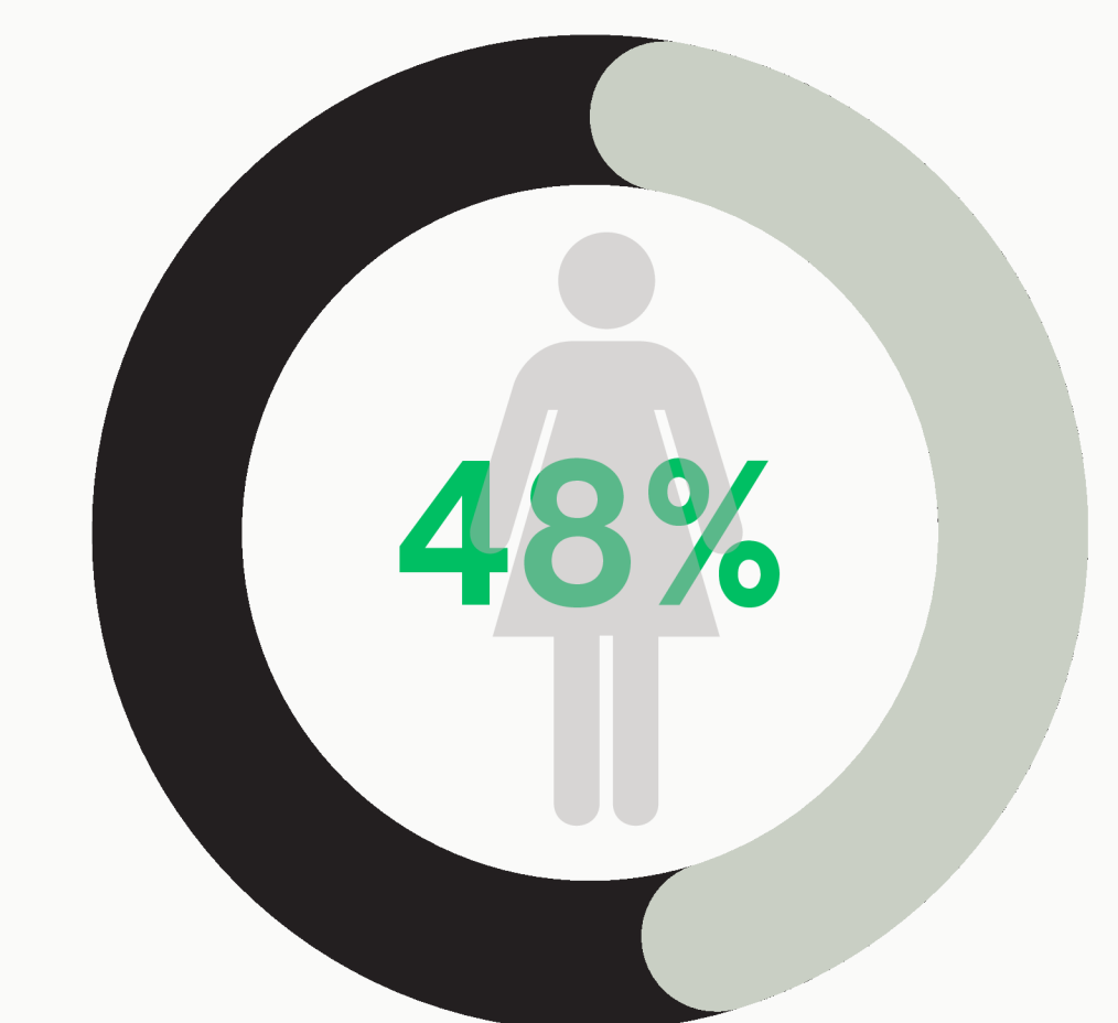
At the end of December 2023, RTÉ employed 1,836 people, with a gender breakdown of 52% men and 48% women.